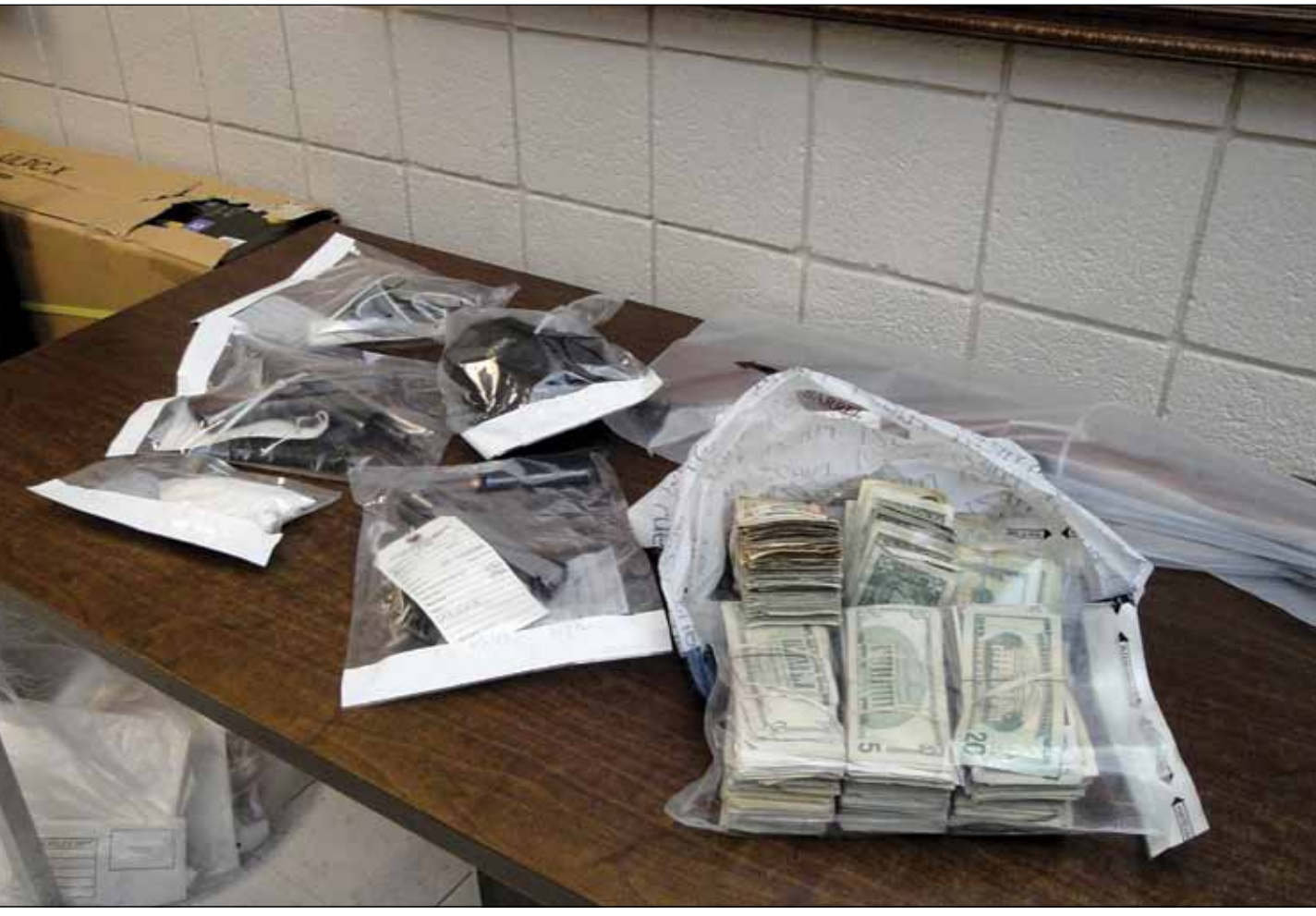
Weapons and money seized by U.S. Drug Enforcement Administration